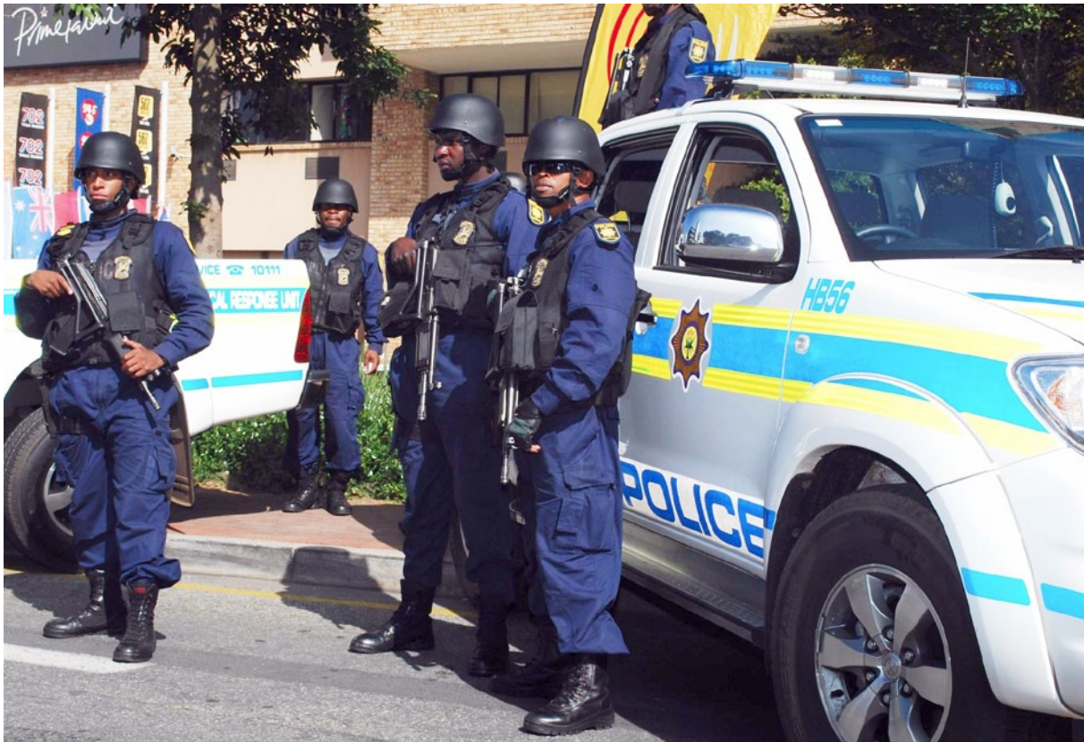
The Smart Policing project is being implemented between 2013 and 2015 in Brazil, Kenya and South Africa.

violence amongst members of the public, both in Latin America and the Caribbean 54 and elsewhere. 55 Though the examples are less numerous, there are also emerging instances of “ICT use connecting state entities and civilians to prevent and reduce violence.” 56