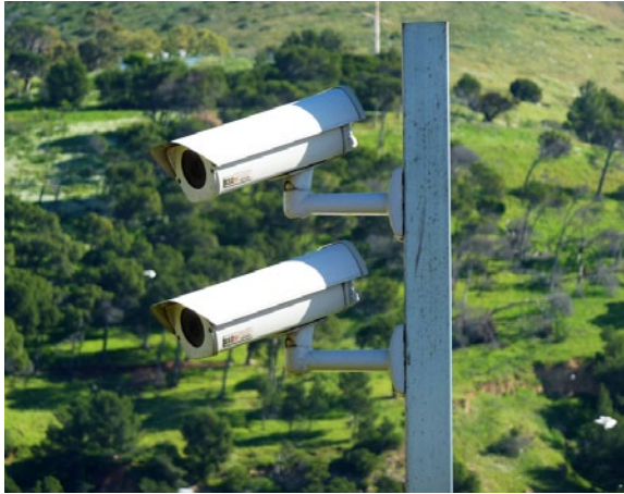
Monitoring cameras in Cape Town.

There are also various examples of new scanning devices, increasing the capability of police to detect contraband or even identify individuals armed with a weapon. There are many projects in various stages of piloting and testing, including the TruNarc Laser Drug Scanner and the Zebedee.