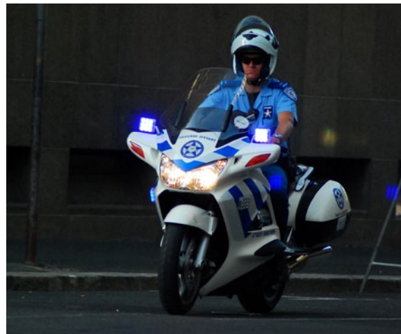
Police patrolling in Cape Town.

In order for technologies of this kind to actually increase accountability, police management must be firmly oriented towards holding officers to professional standards of conduct. This is of course a necessary but not a sufficient condition for cameras to be used to improve accountability. What is also required is a bureaucracy that is efficient enough to ensure that monitoring technology is maintained in working order. In addition, the task of viewing audio-visual material is likely to be neglected if it is simply added to the list of police managers' responsibilities. Dedicated staffing is likely to be necessary to ensure that a random selection of the large volume of material generated is subject to scrutiny.