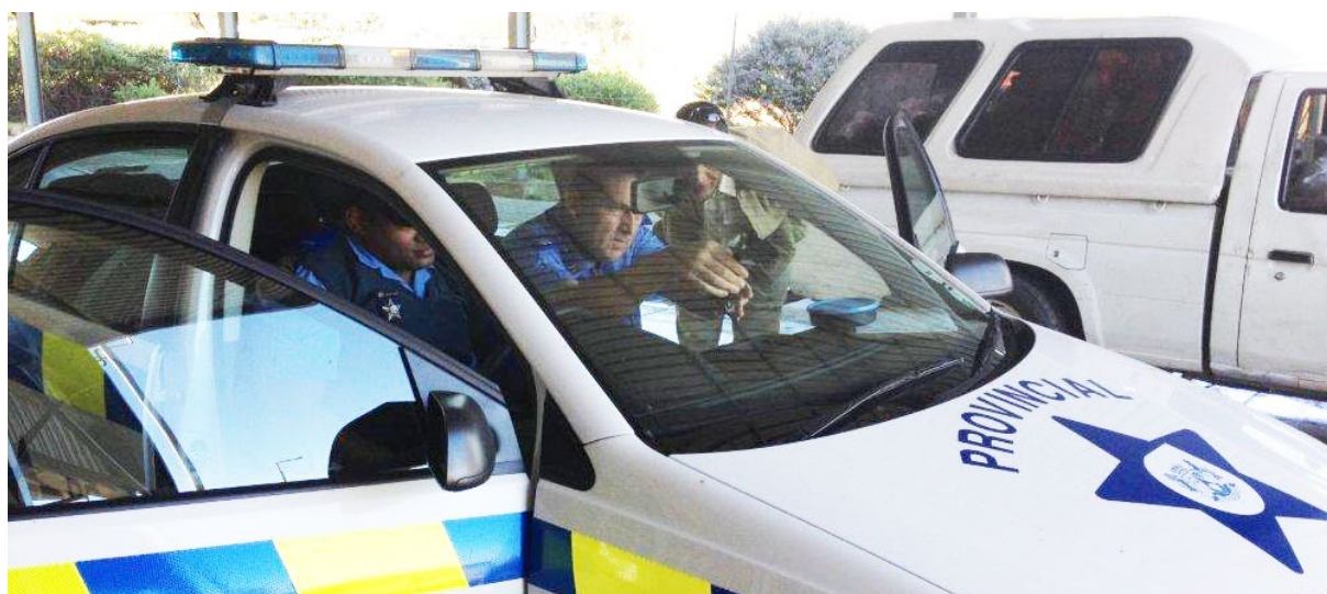
Smart Policing being tested in a police vehicle in Cape Town.

The Smart Policing pilot is being administered in conjunction with another fixed camera pilot project. The Provincial Traffic Department recently launched an initiative to test the use of Revealmia R53-SX cameras. These cameras are mounted to officers' shirts and collect data over long periods, but lack a live streaming function. Records must be downloaded after the officer returns to the police station. While lacking the open-source component of Smart Policing and its inter-operability with smartphones, the fixed camera pilot programs have registered some initial positive results. For example, they have generated evidence for drunk-driving arrests and related civilian interactions.