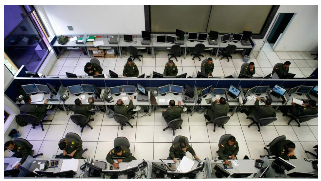
May 3rd, 2008, Bogota.

digestible, parts. It will also almost certainly demand the development of multi-stakeholder arrangements and public-private partnerships to raise capital. Cities are experimenting with blended finances, special municipal taxes, social impact bonds, targeted subsidies and incentives for private investment, among other measures.<sup>61</sup>